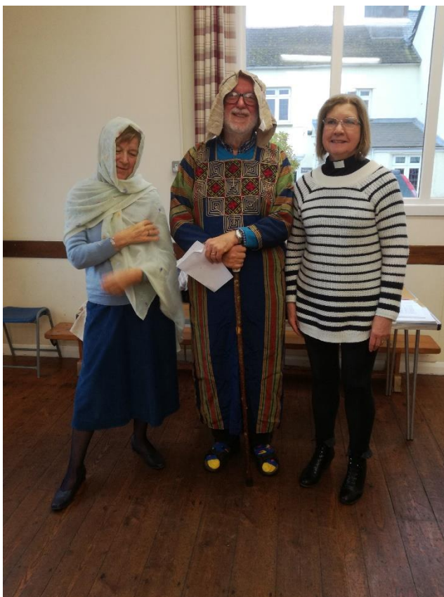
The Open the Book team take Christian bible stories into the schools in High Bickington and Lovacott

There are approximately 20 baptisms, 15 weddings and 20 funerals each year.