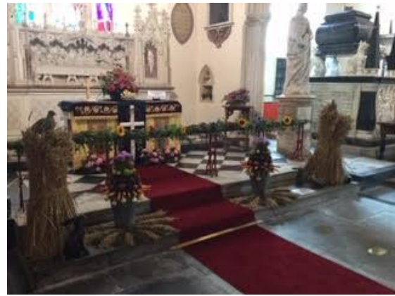
Tawstock church is a popular attraction for visitors

Tawstock is a large, rural parish, bordering south-west Barnstaple. It comprises several hamlets as well as the village of Tawstock itself. Total population is 700. The village boasts a church primary school and village hall, as well as Tawstock Court, a popular wedding venue. The parish is predominantly rural and agricultural festivals are important events in church.