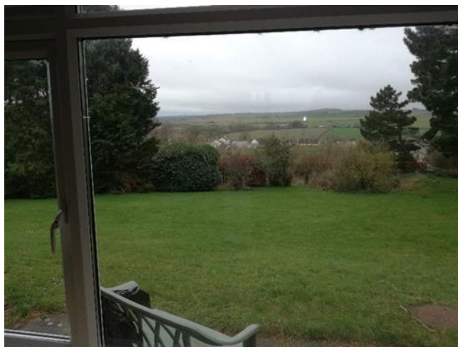
The view from the lounge window