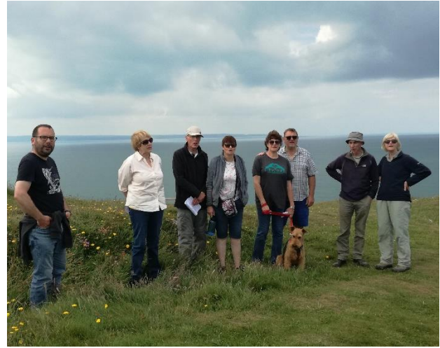
Prayer walking at Baggy Point

The Two Rivers Mission Community covers 55 square miles of beautiful Devon countryside between the principal town of Barnstaple and the market towns of Bideford and Torrington. The famous surfing beaches of Croyd, Woolacombe and Westward Ho! are just a short drive away and national parks of Dartmoor and Exmoor are withing easy reach.