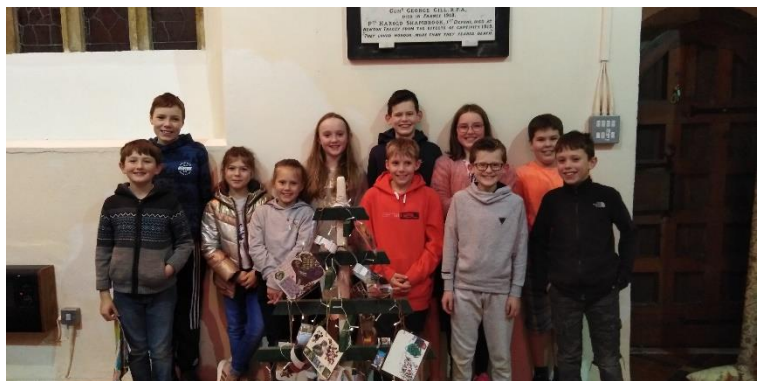
The youth group in Newton Tracey

We are working on our provision for children and teenagers and have now built up to an out of school club (school years 1-6) and two youth groups (aged 8-12 and 10-14). We trust that more provision will be in place soon. Relationships with schools are good and each of the four schools in the Mission Community welcome church assemblies.